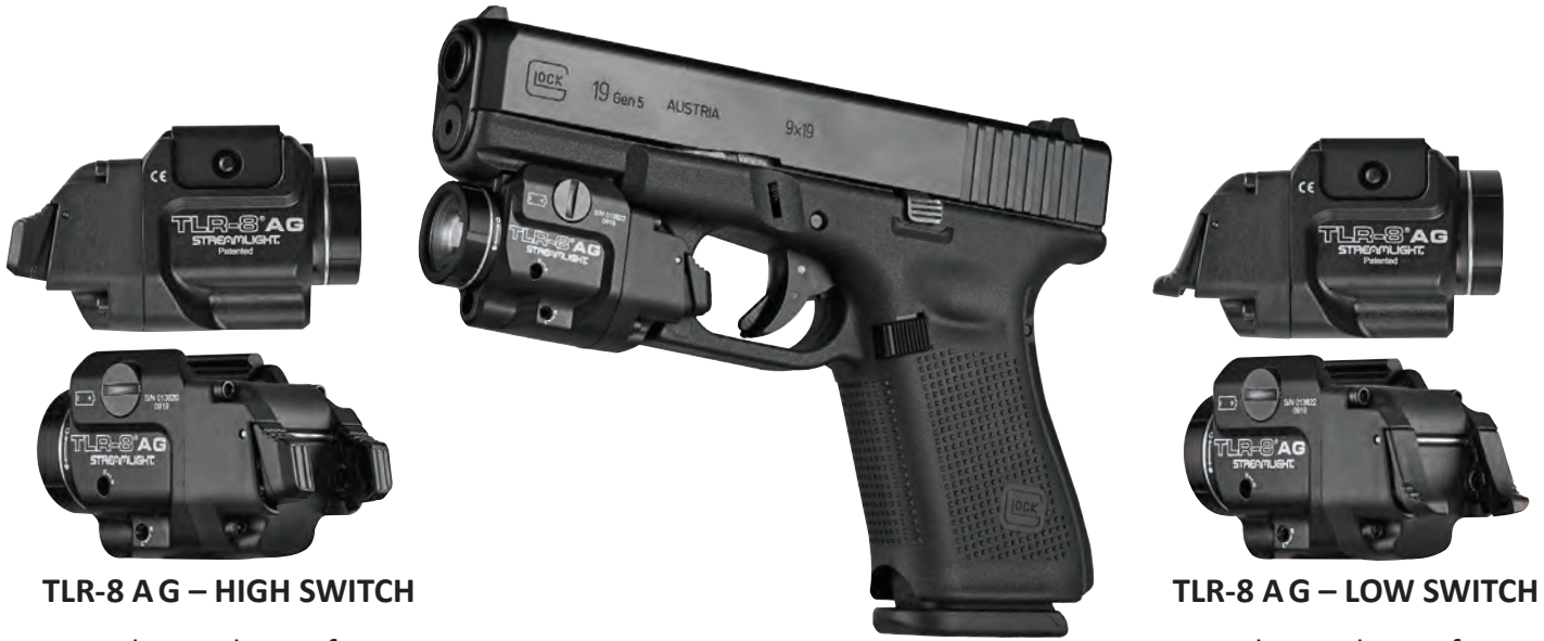
TLR-8 AG – HIGH SWITCH

For those who prefer a “Higher Grip Style”