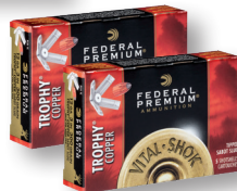
TROPHY COPPER SABOT SLUG