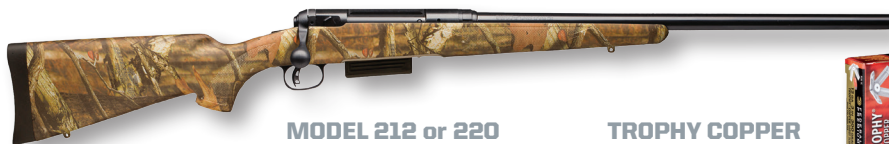
MODEL 212 or 220

*Qualified Canadian residents will receive a rebate check in U.S. funds. Limit 2 per address. Purchases may be made separately, but must redeem for both the firearm and ammo purchases together to qualify.