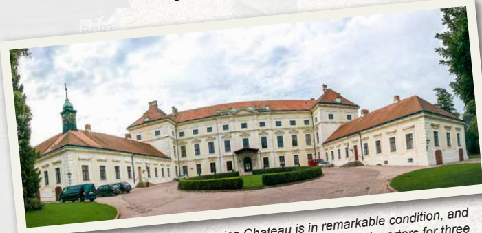
The Zidlochovice Chateau is in remarkable condition, and beautifully decorated. It was our headquarters for three days of driven pheasant shooting.

Zidlochovice Chateau Zidlochovice, Czech Republic 18-20 December 2021