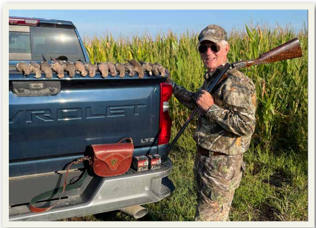
My Purdey 28 gauge is a wonderful, lightweight dove gun – 5-1/2 pounds.

This year's season began on September 1, as usual, and ended for me on October 1. Things had been hot and dry all summer, which was good for the dove hatch. Our sunflower fields turned out pretty good and the weather pattern was consistently nice during the whole season. My schedule allowed for six hunts – three in the morning and three afternoons. I hunted two distinctly different hunting