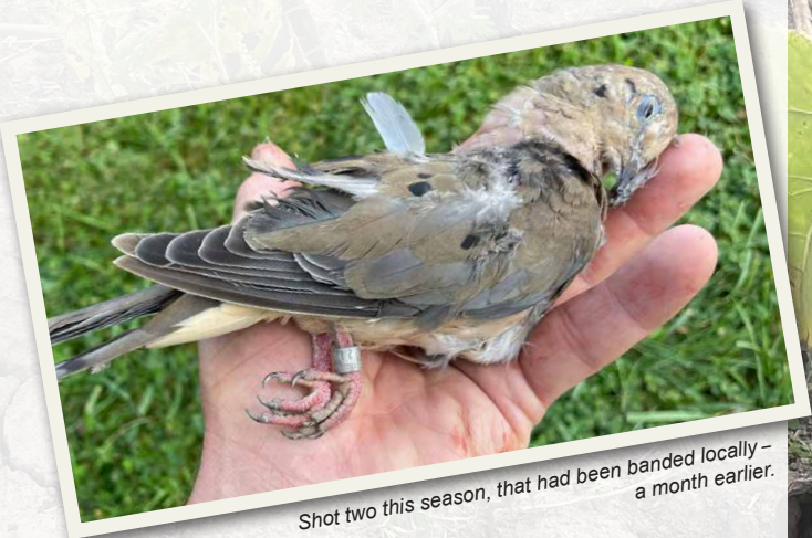
Shot two this season, that had been banded locally – a month earlier.