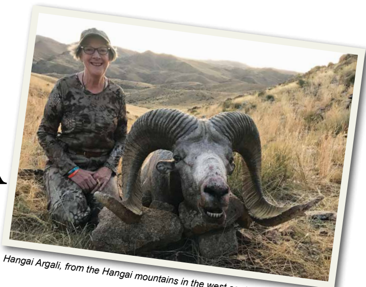
Hangai Argali, from the Hangai mountains in the west central part of Mongolia.