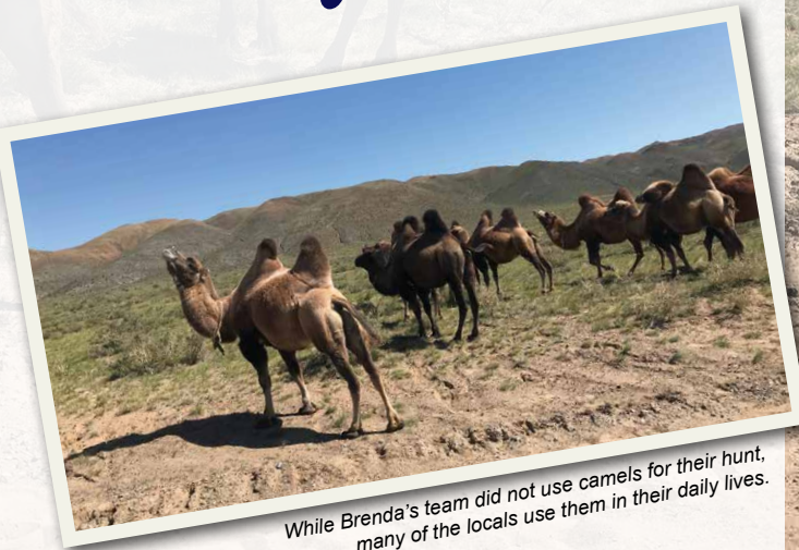
While Brenda’s team did not use camels for their hunt, many of the locals use them in their daily lives.

Larry Potterfield Mongolia, without me August/September 2019