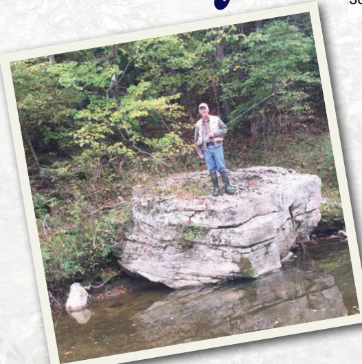
This is a picturesque creek, with several rock slides and big boulders, coming off the higher banks.