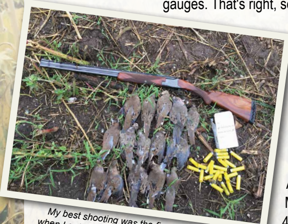
My best shooting was the first day (almost always is), when I got 15 birds with 25 shots from my old Browning Superposed 20 gauge, made in 1949.