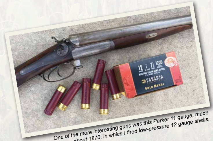
One of the more interesting guns was this Parker 11 gauge, made about 1870, in which I fired low-pressure 12 gauge shells.