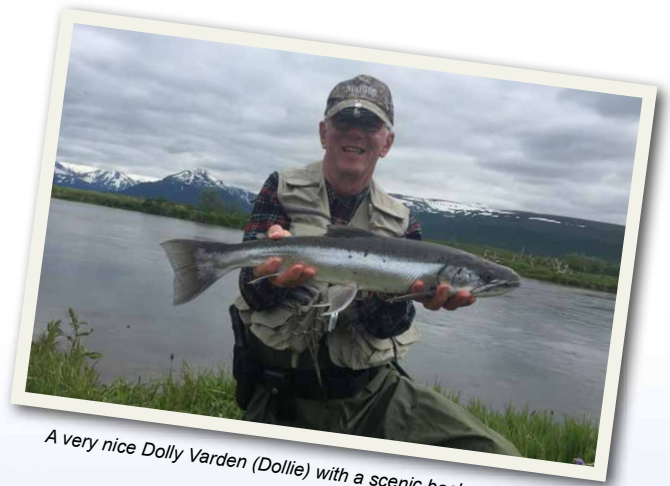
A very nice Dolly Varden (Dollie) with a scenic backdrop. Yes, this is bear country; and I'm packing.

Bear Creek Bear Lake Lodge Port Moller, Alaska 30 June to 7 July 2018