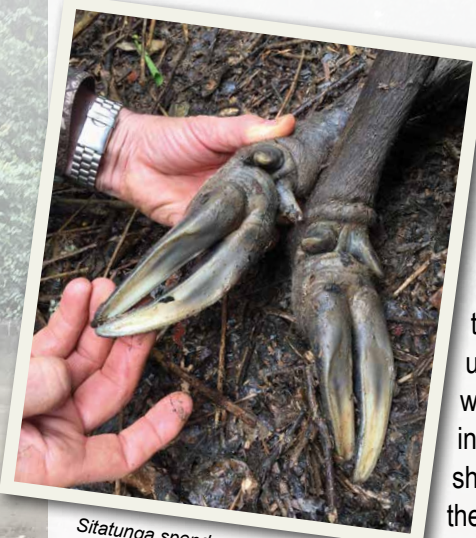
Sitatunga spend much of their time in the water. The hooves are noticeably elongated to help them navigate through the mud – these are the front feet.

Sitting in an elevated blind by a salt lick was the easiest; it required only a short walk on a groomed trail through the jungle, then a climb into a covered but open blind. Had tried that twice, but seen only a dwarf forest elephant (quite rare) and a few birds.