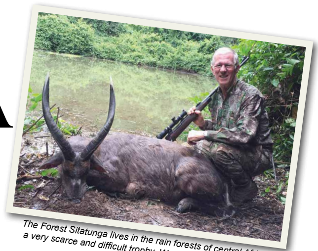
The Forest Sitatunga lives in the rain forests of central Africa. It is a very scarce and difficult trophy. We caught up to this one in the waterhole behind me.

Waiting on a dirt road, while the dogs and trackers pushed one through the jungle trying to drive him out and across the road in front of us, was a little better. We listened for the dogs and ran quickly up or down the road, when necessary, to be in the right position for a shot. The PHs said that they slow down on the hard surface of the road, providing a brief opportunity for a shot in the 50-foot road