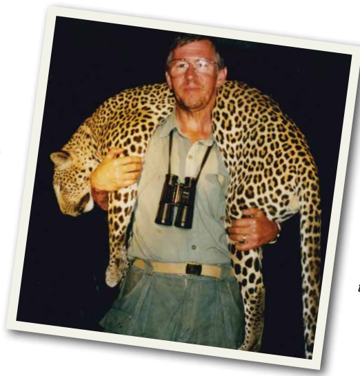
The classic pose of a hunter and leopard; the trackers place the leopard around your neck, the pictures are taken, and they remove him. Yes, there's always blood on your shirt!

When it came my turn to shoot a leopard, on our Family safaris, everything was routine. We found the track of a