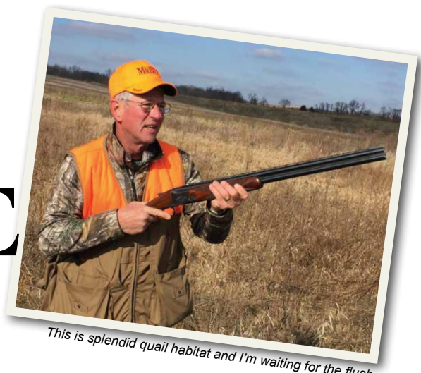
This is splendid quail habitat and I'm waiting for the flush.

My first recollection of quail hunting was with Dad when I was big enough to tag along, but not old enough to carry my own gun. A favorite memory was when a big covey flushed, Dad fired twice with his old 12 gauge hammer double — and three birds dropped. Growing up on the farm, we always had at least one or two coon hounds and one quail dog — normally a setter.