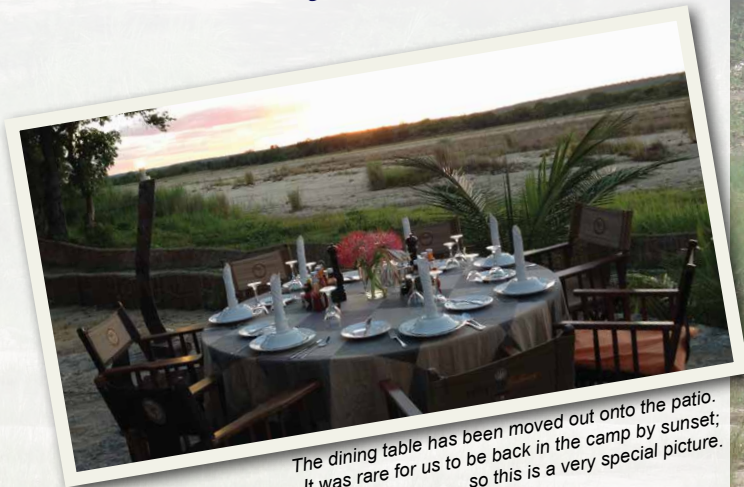
The dining table has been moved out onto the patio. It was rare for us to be back in the camp by sunset; so this is a very special picture.