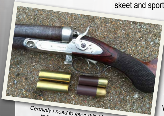
Certainly I need to keep this 10 gauge Parker, made in the 1870's. The brass shells I've loaded with black powder and the plastic shells are light loads of smokeless powder — to be safe in the twist steel barrels.

Larry Potterfield Columbia, Missouri 29 December 2015