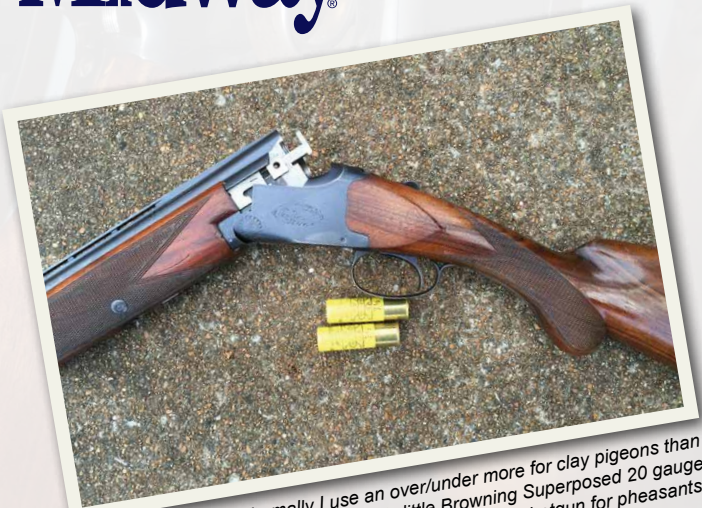
Normally I use an over/under more for clay pigeons than for hunting, but this little Browning Superposed 20 gauge is my favorite shotgun for pheasants.