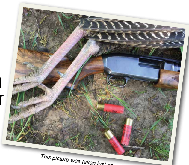
This picture was taken just as a permanent reminder that three shots were fired.