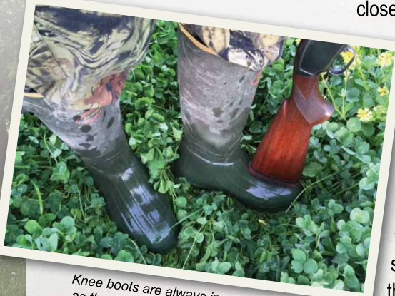
Knee boots are always in order for turkey hunting, as the grass (or in this case clover), is always wet with the morning dew.

Moniteau Creek Harrisburg, MO 29 April 2015