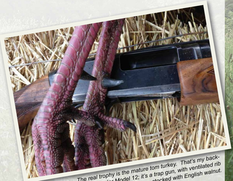
The real trophy is the mature tom turkey. That's my back-up Winchester Model 12; it's a trap gun, with ventilated rib and re-stocked with English walnut.