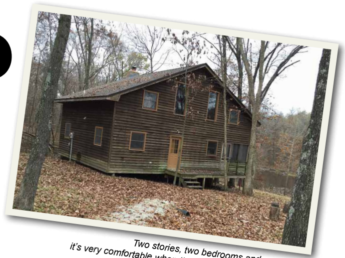
Two stories, two bedrooms and a full bath; it's very comfortable when the whole family gets together.

Unfortunately, this area was on the east side of the farm and close to the property line, with an interior road on the other side of the fence. Building that close to a neighbor wouldn't have offered much privacy – so we waited. In the summer of 1989 that farm came up for sale and Brenda and I bought it. Now the plan could go forward. A contractor, with a big trackhoe, cleared the trees from the dam and main area of the lake, dug out the rock culvert and repacked the cut. The lake was finished; all we needed was rain.