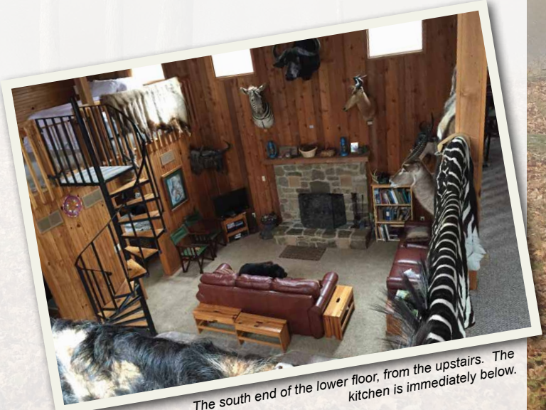
The south end of the lower floor, from the upstairs. The kitchen is immediately below.