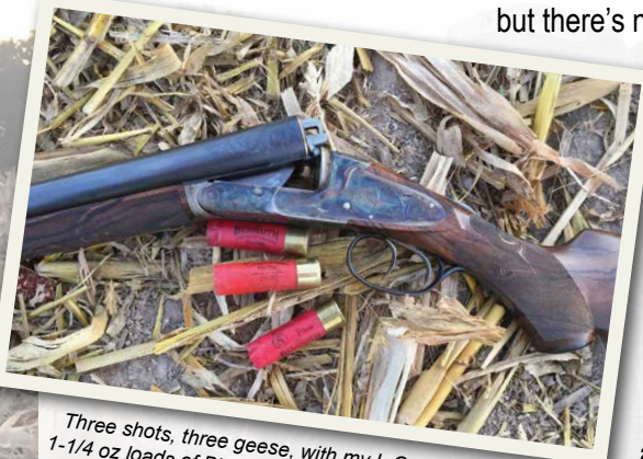
Three shots, three geese, with my L.C. Smith 12 gauge and 1-1/4 oz loads of Bismuth #5 shot. The shots were close and I used improved cylinder and modified choke tubes.

One of the important variables to success is the timing of the corn harvest, because the geese begin feeding in the corn fields as soon as the farmers pull out. This year, because of dry weather, the corn came out right on schedule and the geese moved in. Another variable is choosing the right field to hunt; you have to pattern the geese. There's a good chance that the field they feed in tonight will be the same one they fed in last night – but there's no guarantee.