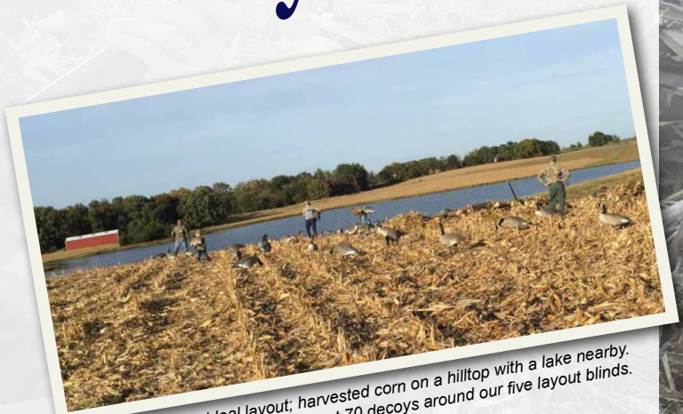
This is a pretty ideal layout; harvested corn on a hilltop with a lake nearby. We had about 70 decoys around our five layout blinds.

Larry Potterfield Coats Place Farm Columbia, Missouri 10 October 2015