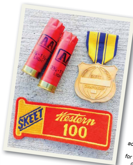
The ammunition companies have long offered patches like this, so shooters can display their accomplishments. The medal was for first place in 12 gauge 'C' class.

Armed Forces Skeet Championships Ent Air Force Base Colorado Springs, Colorado Spring, 1975