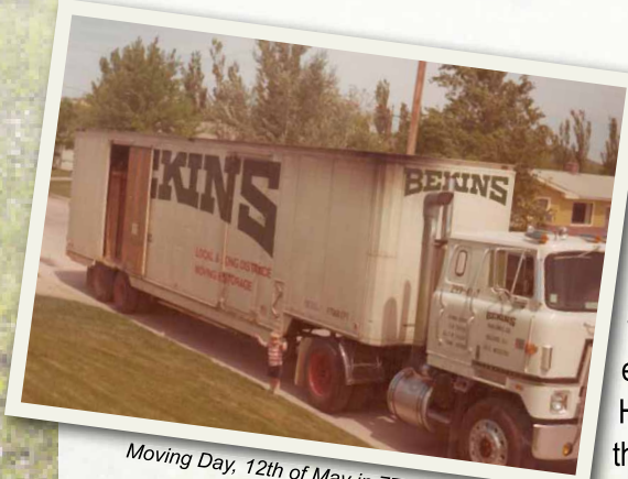
Moving Day, 12th of May in 77. That's son Russell, at the curb -- not quite 3 years old.

At the Gunshop 7450 Old Highway 40 West Columbia, MO 18 June 1977