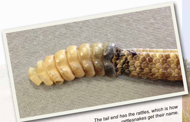
The tail end has the rattles, which is how rattlesnakes get their name.