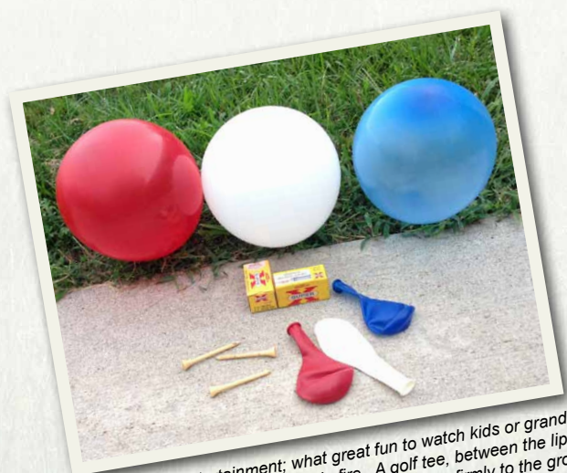
Pure entertainment; what great fun to watch kids or grandkids break balloons with a .22 rimfire. A golf tee, between the lip and the knot, holds the balloon firmly to the ground.