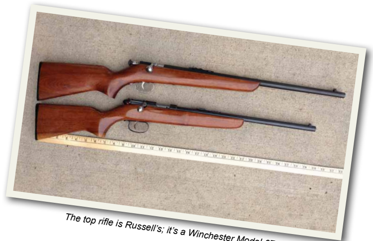
The top rifle is Russell's; it's a Winchester Model 67. Sara's below is a Remington 514.

When Sara turned four, she was a bit smaller than Russell had been at that age. In my mind, she needed a lighter rifle and one that cocked on closing rather than by pulling