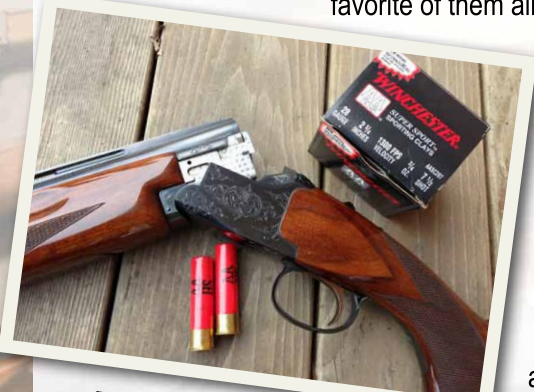
This Winchester 101 in 28 gauge didn't appear to have ever been shot, until it found its way into my collection.

learn at a gun show that could possibly change one's life? Well, consider this: at a gun show especially a large one - there are literally thousands