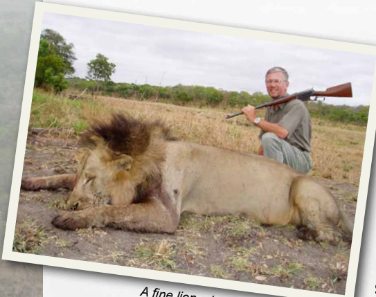
A fine lion, shot with a grand old rifle.