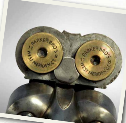
We marked the heads of the turned brass shells just like the originals.

When the gun arrived, I inspected it thoroughly and gave it a good cleaning. Except for a small coil spring that was missing, but easily replaced, it was completely functional and sound enough to shoot - with black powder loads, of course. However, as we soon discovered, there was another problem; it wasn't a 12 gauge and it wasn't a 10 gauge - no, this gun featured the rare 11 gauge