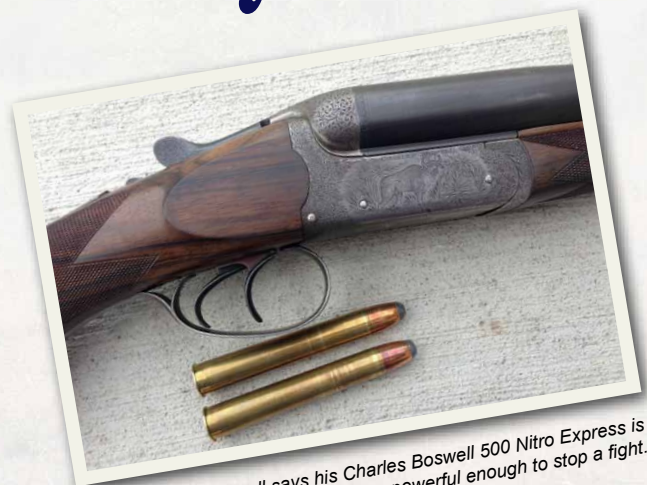
Russell says his Charles Boswell 500 Nitro Express is powerful enough to stop a fight.